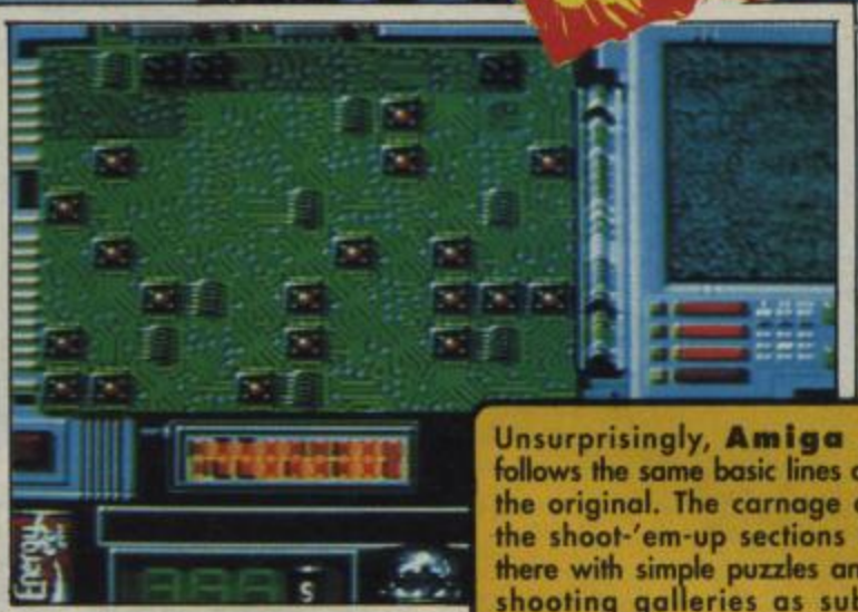
★ During the game, RoboCop must recover his memories of himself and his wife via this section. (Amiga)