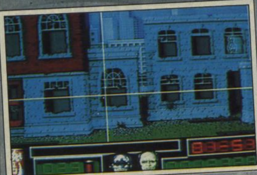
★ RoboCop practises on the shooting gallery. (Amiga)

The Amiga version of Robo 2 may not be that original, but who cares? 2 sets a new standard for the Amiga, with excellent animation, full use of the Amiga's superb colour palette, silky scrolling and digitized sound FX. A full blooded Amiga game!