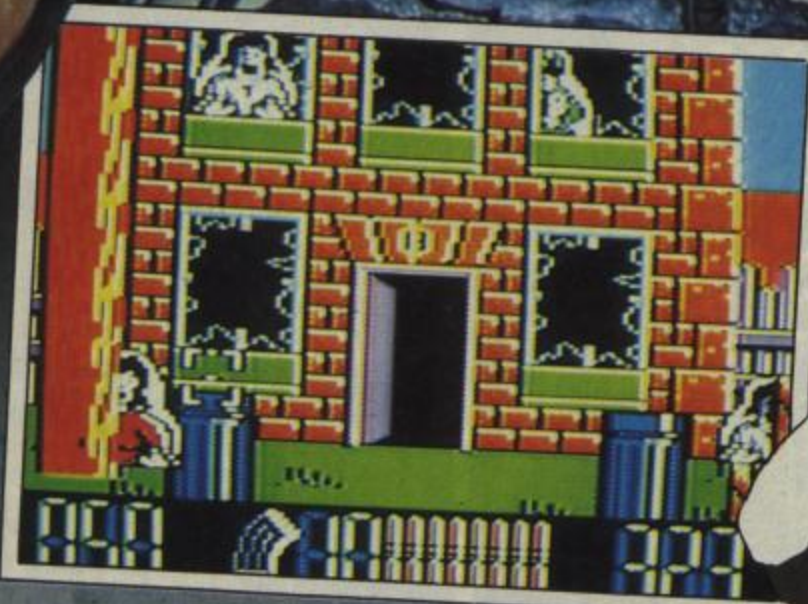
★ Terminate the perps and save the hostages in the shooting gallery screen. (C64)