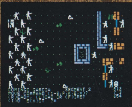
Or a battle of uneven odds — 7 sharpshooters against 20 bandits... plus seven other scenarios.

Screen displays shown are from the APPLE® Displays from other computer(s) may vary.