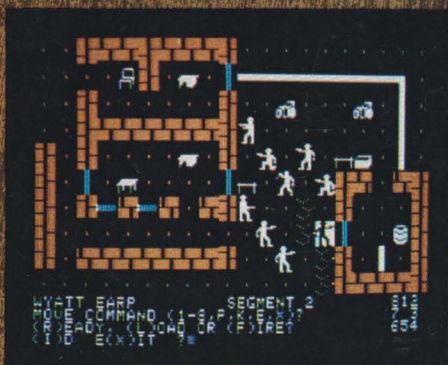
You can re-enact the infamous gunfight at the O.K. Corral...

SIX-GUN SHOOTOUT can be played by two players, or one against the computer.