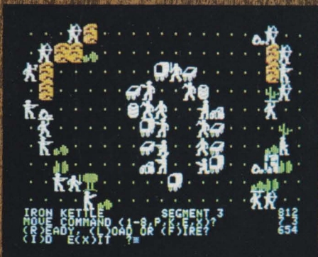
Or the popular theme of Indians attacking encircled wagons...